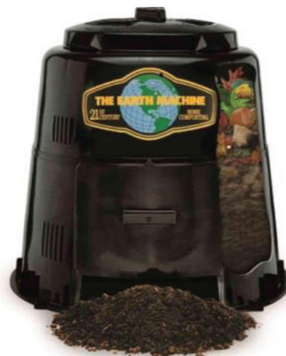
Left: Composting display at Deep Cut Gardens, Middletown. Right: “The Earth Machine” recommended by Monmouth County for home gardening composting.